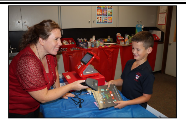
2022 Scholastic Book Fair!

The CES Scholastic Book Fair was a great success. A percentage of all purchases is used to buy new books for the school library, as well as classroom libraries for all grades. All donations made towards classroom wish lists were met by grateful teachers and students who are excited to read them. Thank you for your support in helping us grow happy readers!