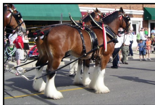
Mrs. Hanes and her 4th

graders went to the Nacogdoches Civic Center to view and visit with the world-famous Clydesdale horses . They were in town to be a part of the annual Nine Flags Lighted Christmas Parade, held on December 6th. Clydesdales have a large stature, trademark feathering around their legs, and a high-stepping gait. Despite their imposing size, they are typically very gentle and easygoing. They can weigh between 1,800 and 2,200 pounds and their height is can be 17 to 18 hands tall. One "hand," is four inches.